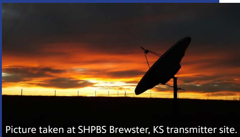
Picture taken at SHPBS Brewster, KS transmitter site.

Your feedback is the best way for us to measure how well we are serving Central and Western Kansas. Please do not hesitate to let us know how you feel about our programming, events or services. We welcome comments and questions by phone, email and mail. In addition, you can learn more about Smoky Hills PBS programming and services by visiting SmokyHillsPBS.org .