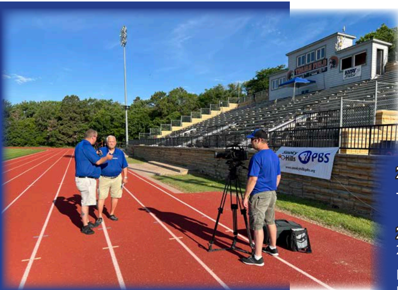
2022 8-Man All Star game